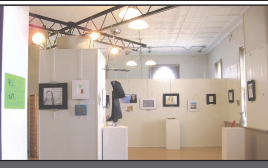
A view of the south gallery